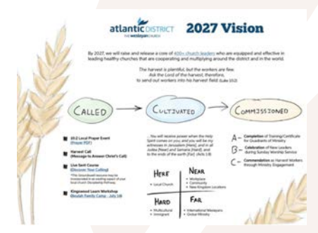
The Meductic Mandate – 400 New Kingdom Leaders by 2027

My friends, whether you are lay leaders or clergy – we all share a Meductic Mandate. God has called us to the end of a path. It IS a desired destination regardless of whether it is big or small, well-known or forgotten. Others might consider your place of ministry insignificant, an out-of-the-way assignment, but the Meductic story is a powerful reminder that God has positioned you exactly where He wants you to serve in the season of Kingdom influence He has entrusted to you to faithfully steward. There are men and women of faith who will be raised up and released out from under your care and only God knows how their stories will shine for His glory because of your faithfulness. And God has led us as a district through a multiple year journey leading into this post-pandemic season to embrace a modern-day Meductic Mandate. Please take out this cardstock 2027 Vision item as we prepare to read it together.