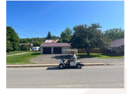
2023 Site of the Reformed Baptist Church of Meductic

So, you may be wondering – why are we talking in 2023 about a church that closed 55 years ago in 1968, two years before I was born? I will answer that important question in a moment, but first let's dig just a little deeper. Here is what remains of this church building today – directly across from 35 Main St., Meductic.