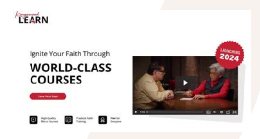
Kingswood Learn Workshop – Backstage Pass 1:30 p.m. Friday (Tabernacle)

First and foremost, each Lead Pastor is encouraged to schedule a call to prayer in the spirit of Luke 10:2 to lay the foundation for God to move in our churches. We are asking this would occur sometime this fall before the Advent Season. This may be with only the pastoral team, and/or ministry leaders, and/or the board, a combination of these, or with the entire congregation. Whatever is best for your context. Our first step must be to invite the moving of the Lord of the harvest to call out the workers He needs for the reaping ahead in the four quadrants of our Acts 1:8 mission.