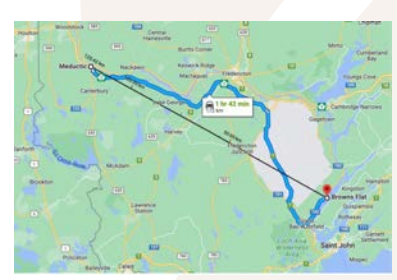
Google Maps - Meductic: There & Back Again

Meductic. Very few of us in this historic Tabernacle today could find it on a map. Even fewer would know how to spell it. Unless, of course, you are a drummer and a fan of Sabian cymbals which have been headquartered there since 1981. Meductic. Centuries ago, it was an epicentre, the place to be if you were a somebody – the capital if you will – of the Maliseet First Nation.